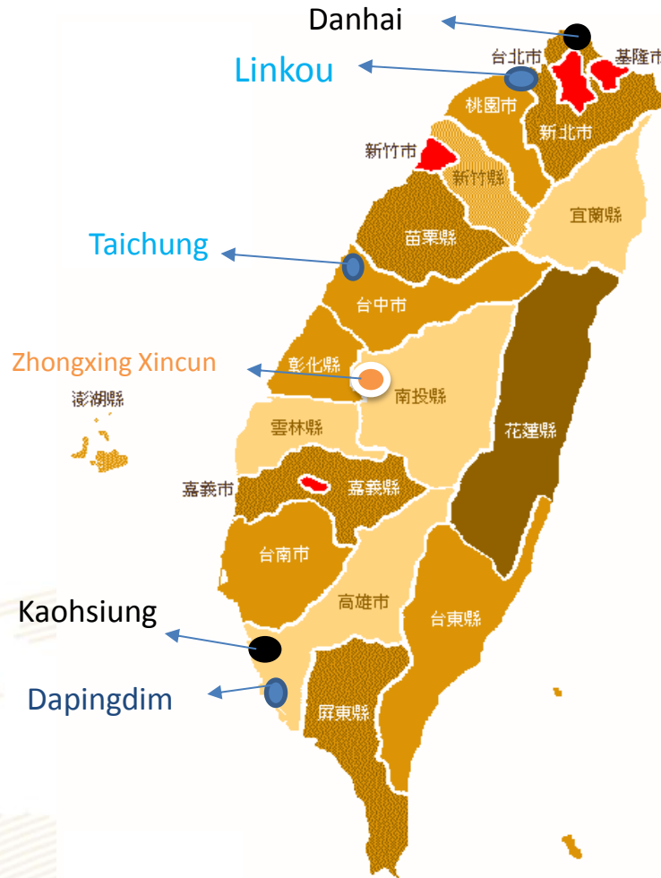
Map 1: The map of the locations of Taiwan's new towns